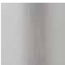
POLISHED STAINLESS STEEL (-401)